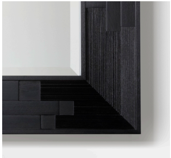
DENMARK MIRROR 36W X 36H X 2.625D | 40W X 60H X 2.625D