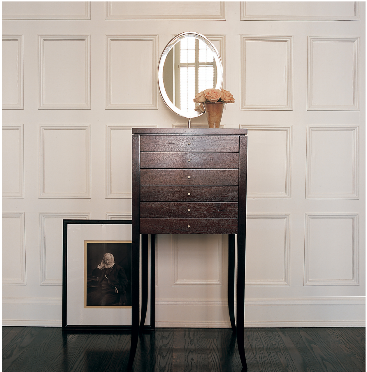
DRESSING STAND 20.5W X 17.5D X 43H, 65 OAH MAXINE SNIDER INC.