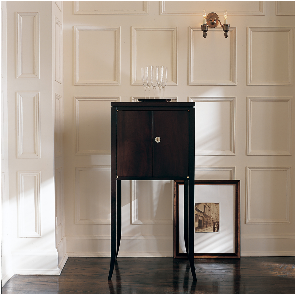
DINING STAND 20.5W X 17.5D X 43H, 65 OAH MAXINE SNIDER INC.