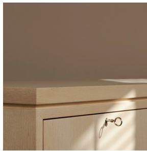
VARENNE WRITING TABLE 38.5W X 17.5 / 32.25D X 41.75H