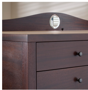
PARIS WRITING DESK 60W X 30D X 34H