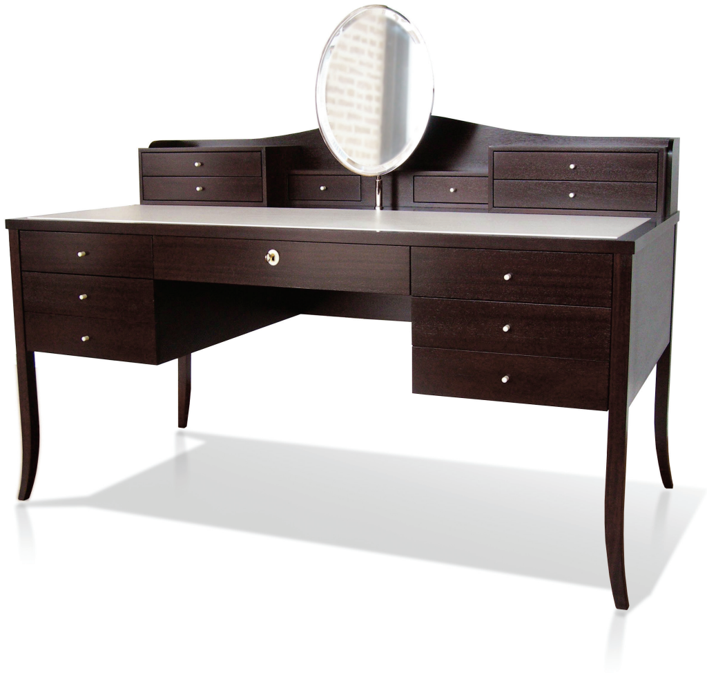
PARIS DRESSING TABLE 60W X 30D X 29H, 51 OAH MAXINE SNIDER INC.