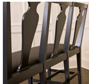
NEW HAMPSHIRE SETTEE 57W X 21.5D X 37H