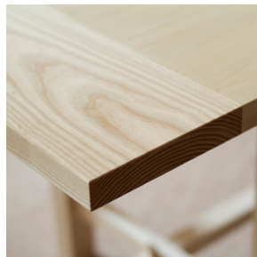
LUND TABLE 87W X 32D X 30H