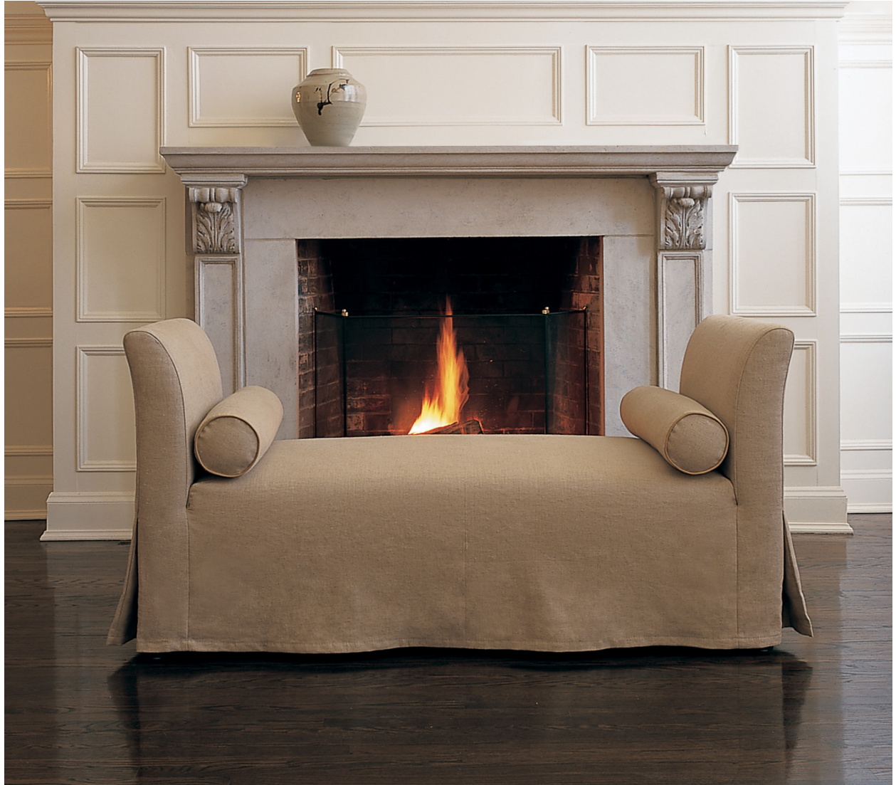
LEFT BANK SETTEE 63W X 27D X 30.5H