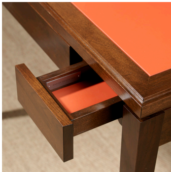
GAMES TABLE 35W X 35D X 30H