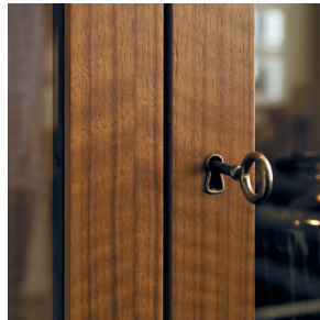
COLLECTOR'S CABINET 46W X 17D X 80H